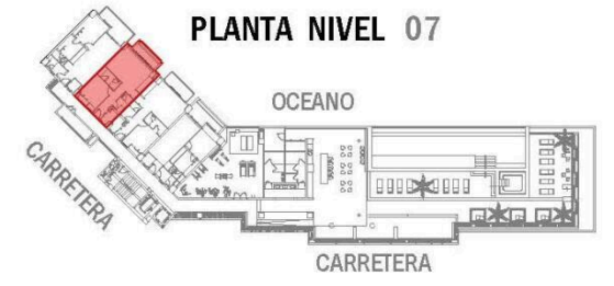
FACHADA NORTE (OCEANO)