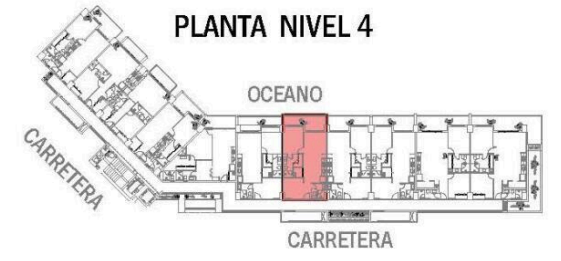
FACHADA NORTE (OCEANO)