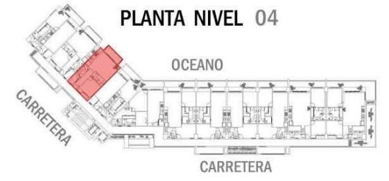
FACHADA NORTE (OCEANO)