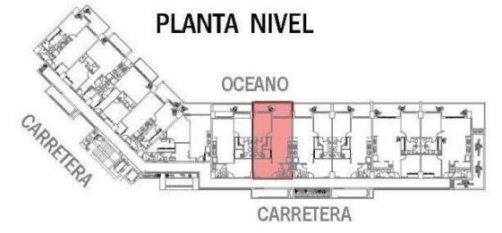
FACHADA NORTE (OCEANO)