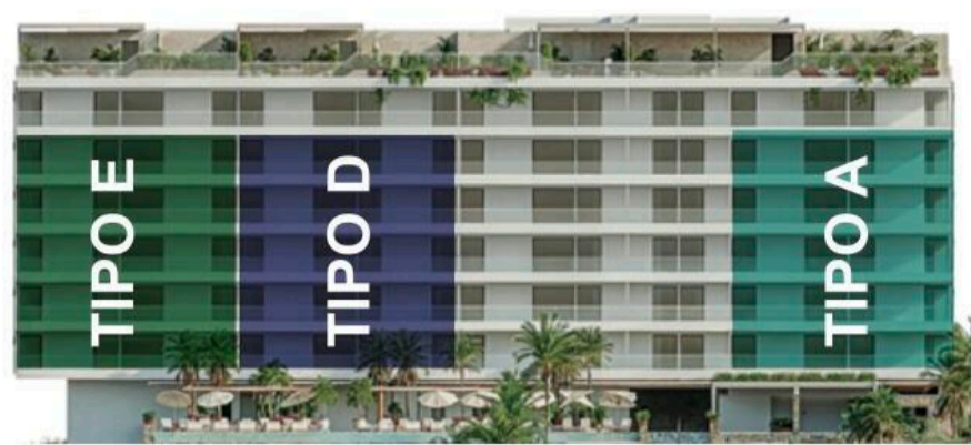
UBICACIÓN EN FACHADA

Superficie interior _____ 160.59 m 2 Superficie terraza _____ 51.18 m 2 Superficie total _____ 211.77 m 2 # Cajones _____ 2