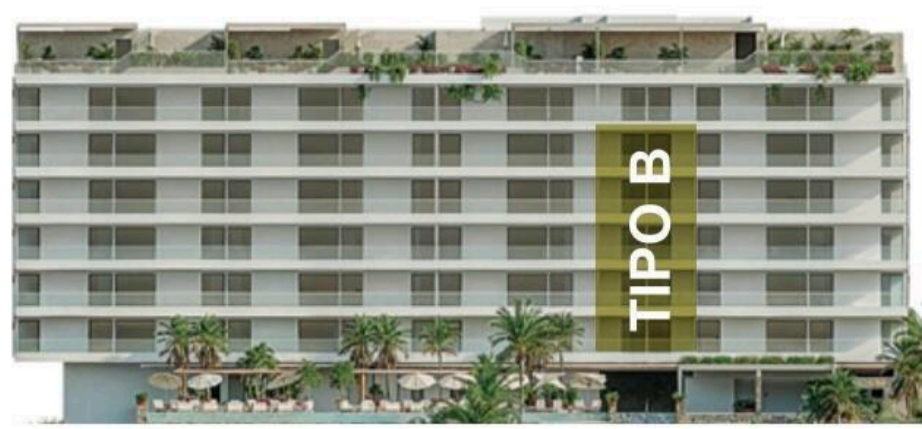
UBICACIÓN EN FACHADA

Superficie interior _____ 74.15 m 2 Superficie terraza _____ 23.92 m 2 Superficie total _____ 98.07 m 2 # Cajones _____ 1