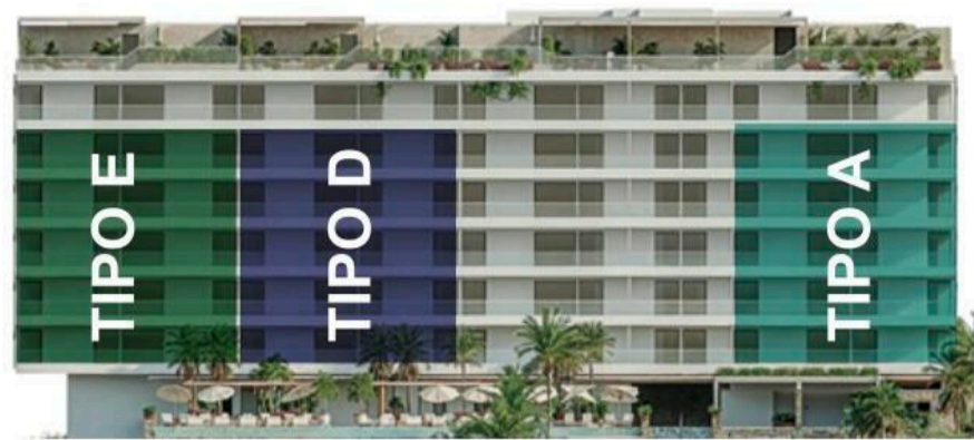
UBICACIÓN EN FACHADA

Superficie interior _____ 160.59 m 2 Superficie terraza _____ 51.18 m 2 Superficie total _____ 211.77 m 2 # Cajones _____ 2